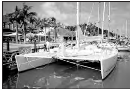
Our transportation to the islands.

How large of a boat was needed to transport seven operators and about 2½ tons of material over a distance of some 800 km? After long investigations, we found a boat in Noumea