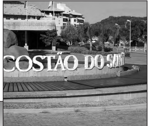
Above and left: Site of WRTC 2006 – Costão do Santinho Hotel, Brazil.

came a wonderful opportunity. The amateurs noted above and some of their friends decided to host the very first WRTC in Seattle, WA, in 1990. The plan was to bring the very best operators in the world to a common location and let them operate in national teams of two from various sites around the Seattle suburbs using comparable antennas, the same power level and similar operating locations in order to level the geographic playing field. In reality, at this first WRTC, the organizers were not totally successful at equalizing these variables.