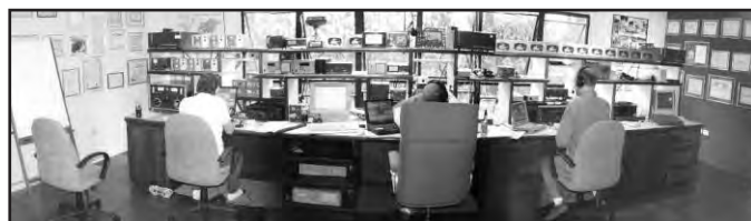
ZW5B (PY5EG) contest station.

• The central site for the games will be located at the 5-star Costão do Santinho Resort on the northeast side of Santa Catarina Island. This complex is located right on the Atlantic Ocean in a magnificent setting with a private beach, multiple pools and restaurants on gorgeous, secure grounds. Most everything at the games, except for the competition itself, will be run out of this complex making it convenient for competitors, judges, guests and spectators alike.