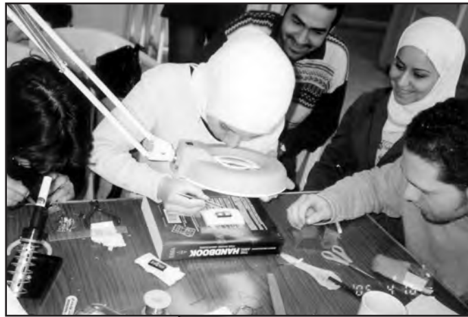
Students working on their project.

of April to deliver only a small part of the components, which allowed the students to make two DDS sets, plus the display, which was to be presented to the college by mid-May. It was a very tight schedule, what with all the other material the students had in preparing for their final examination.