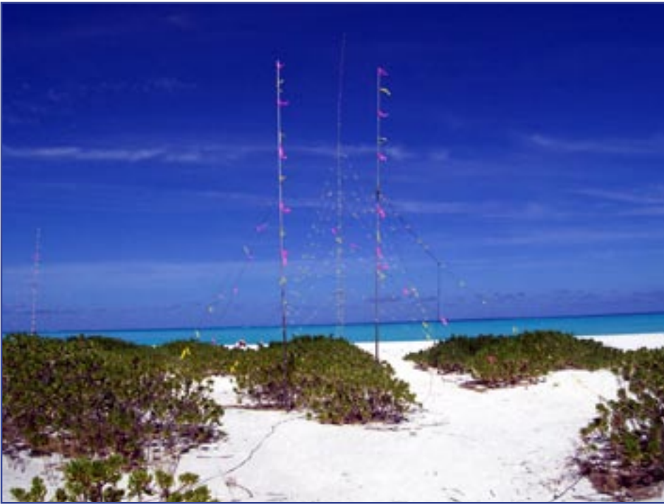
Well-marked antennas as required under our terms of entry into Midway Atoll. Colorful, too. We are pleased to report that no locals were harmed in the making of this DXpedition.