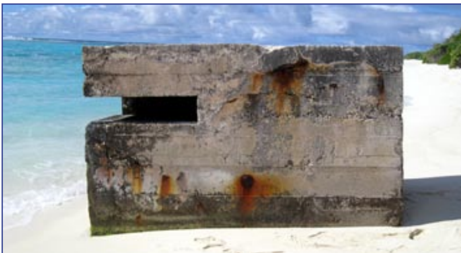
One of the last remaining WWII pillboxes on the beach.

As planned, the operation was separated for the CW and SSB camps, with the stations being about 500 feet apart. The SSB station was set up in a tent, and the CW station was located inside the tavern used by the Midway staff. The CW station was put there so