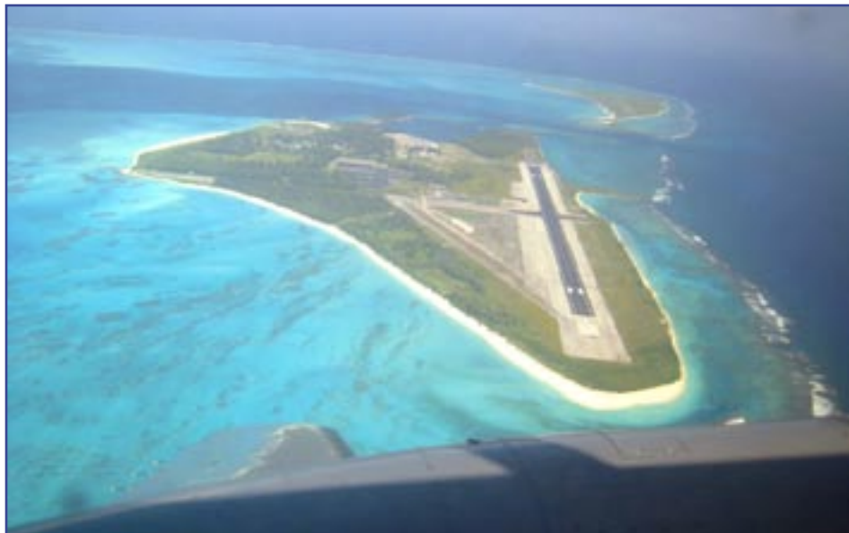
A look back at Midway Atoll from our plane.