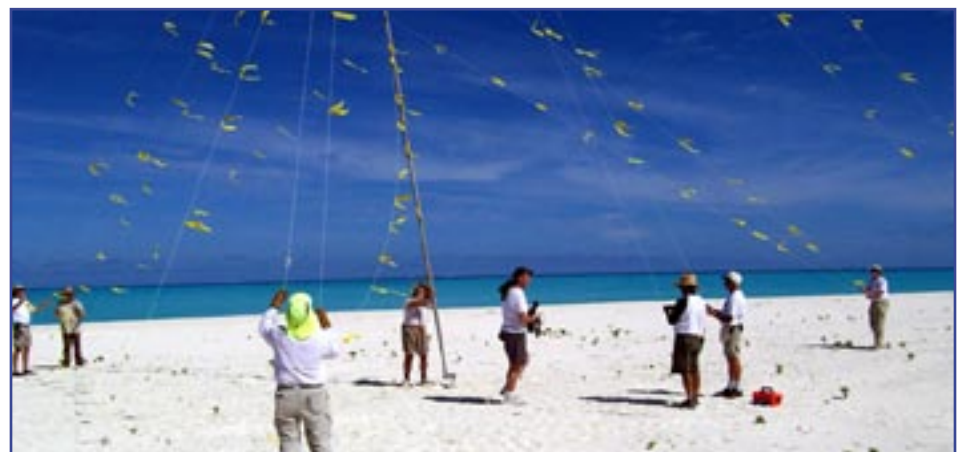
The Titanex going up required everyone, but the results were worth the effort. We put up two.

W8GEX was in charge of daily on-island operations dealing with any and all areas concerning transmitting and receiving, i.e. radio position setup and tear down, cable requirements and needs dealing with positions, on-going maintenance once on island, antennas, propagation, radio prep prior to shipment, etc. For the operating scheduling, Don and Joe worked together to assure the positions were properly manned as required.