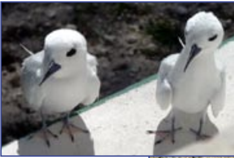
Above: Baby terns. Right: Sea turtles relaxing on the beach.