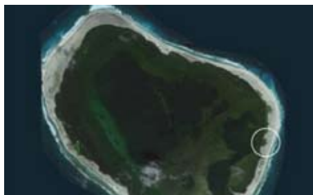
Location of the landing/campsite on Clipperton Island.

The skipper made a tactical decision and selected a very handsome grove of trees, announcing that they would take some boxes ashore. Quickly, I selected the containers with emergency food, lights, radios, medical supplies and a small generator. The Zodiac was away and our spirits soared. But soon they returned with bad news: no more boxes or people, it was too rough. The