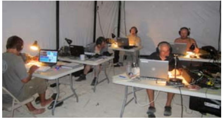
One of the operating tents — from the outside and filled with operators inside.

established a kind of corporation yard: the various shipping cases and gasoline jerry cans were arrayed in rows, providing a kind of open-air warehouse. Most of the team members were busy completing the two radio operation tents, designated Site A (SSB operation) and Site B (CW). Even the sleeping tents had been erected and populated by cots, air mattresses, blankets and pillows. I took the last one, and posted my callsign on the doorway.