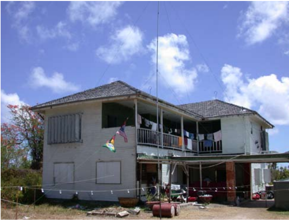
Banaba House, our .333-star rated home-away-from-home.

(Banaba). The International Date Line is bent to the east of this island nation so though they share the same day, they span four time zones. This gerrymandering of the International Date Line causes an anomaly in our world clocks. By definition a day is 24 hours in length, but the Line Island Time Zone is actually 14 hours ahead of UTC, giving us days that are 26 hours from the eastern most time zone to the western most time zone. Banaba, itself, has its own time zone that places local time 30 minutes behind the Gilbert Island Time Zone (Tarawa).