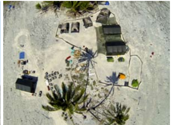
Aerial photo of the TX5K campsite.