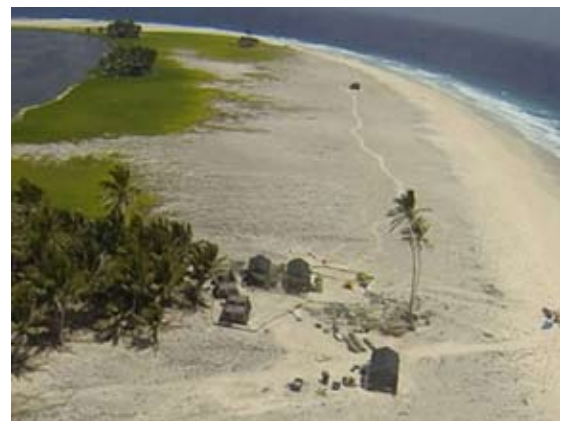
Aerial photo looking north over the TX5K campsite.

By the end of the morning every load of cargo and every other team member was on the island, so I took