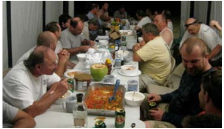
The GEM tent, where we ate our meals (right), and the COM tent next to it.

merged bush, and returned to shore. Expectantly, I started the generator, and waited anxiously for about two minutes. Then, with several burps, fresh cool water came squirting out of the nozzle! I let out a triumphant whoop. The shower worked! I stripped down and easily spent 20 minutes luxuriating in this fresh, cool, clean shower. Because of the intense heat on the island, especially in the morning, every member of the team was suffering, and I figured, correctly, that the shower would be very popular. Indeed, for the rest of the time we were there, a continuous parade of men went to and from the little tree. At the end of our operation, even the most vociferous complainer spontaneously dubbed it “the best thing on the island.”